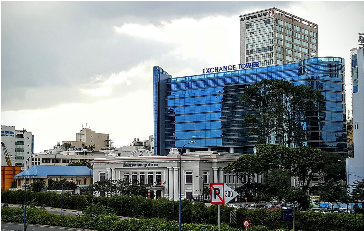
Ho Chi Minh City Stock Exchange