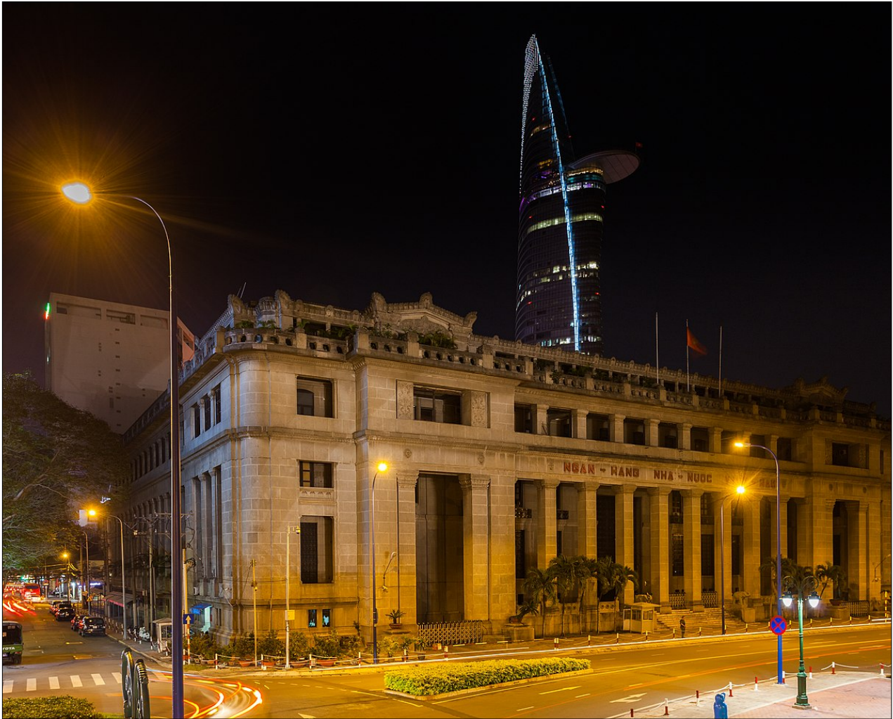
State Bank of Vietnam, Ho Chi Minh City