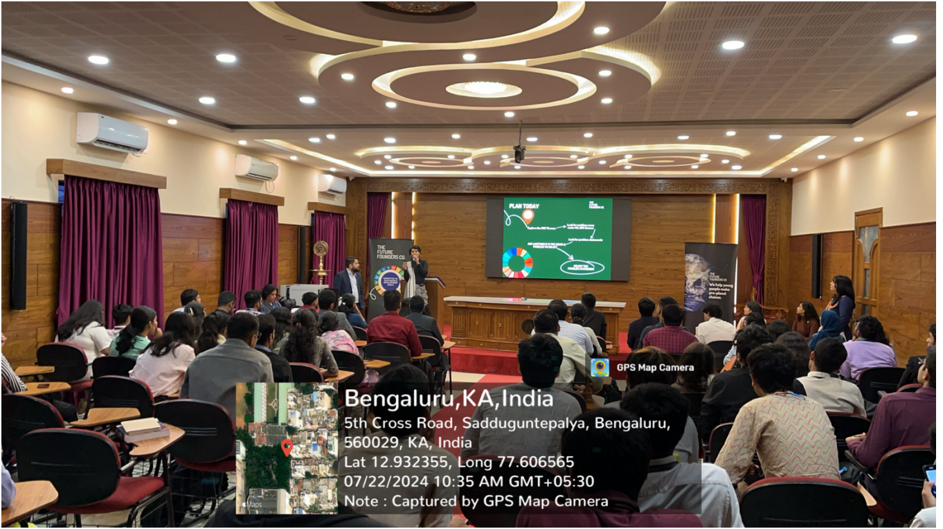
Bengaluru, KA, India 5th Cross Road, Sadduguntepalya, Bengaluru, 560029, KA, India Lat 12.932355, Long 77.606565 07/22/2024 10:35 AM GMT+05:30 Note : Captured by GPS Map Camera