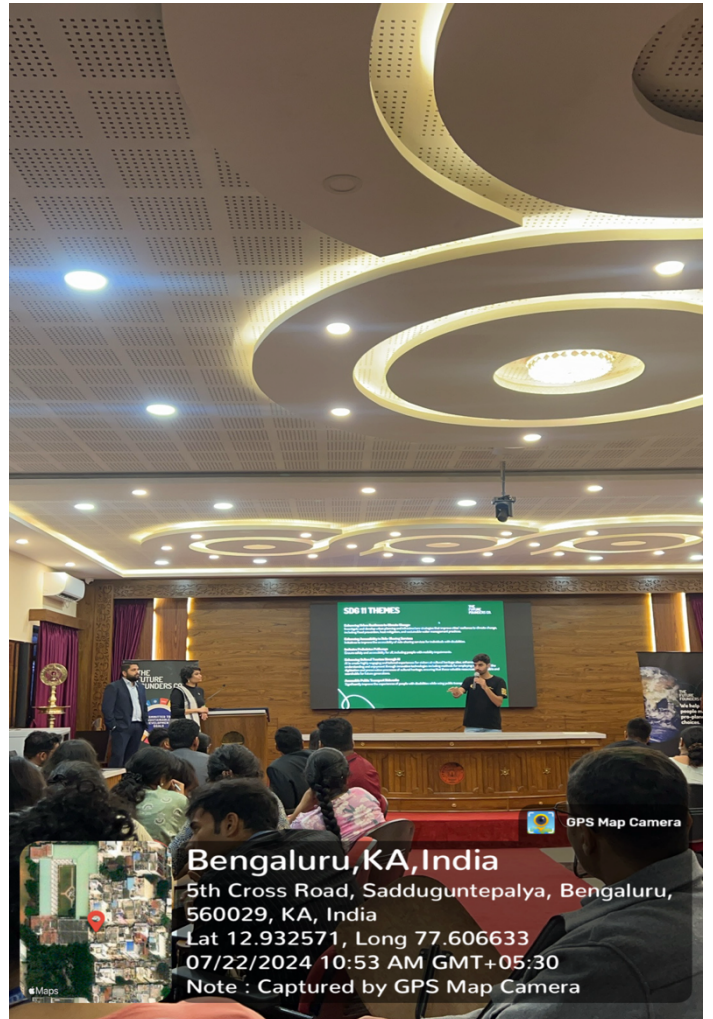
Bengaluru, KA, India 5th Cross Road, Sadduguntepalya, Bengaluru, 560029, KA, India Lat 12.932571, Long 77.606633 07/22/2024 10:53 AM GMT+ 05:30 Note : Captured by GPS Map Camera